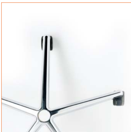
Exclusive Poltrona Frau design 5-spoke base