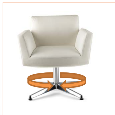
Automatic 'return rotation' mechanism