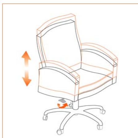
Seat height adjustment